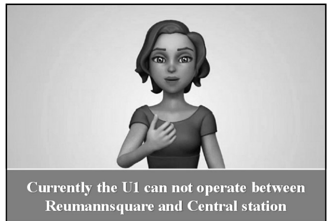
Fig. 3. Video avatar (according to [22])

This means that the user can configure structured incident messages with less complex syntax and a controlled vocabulary. This does not only facilitate the subsequent automatic translation process, but also facilitates understanding of text messages to all other (hearing) passengers. Once the structured incident message is available a video with a sign language avatar will be automatically rendered and stored into a database. The Intermodal Transport Information System (ITIS) determines the affected passengers and distributes to the smart phone of the deaf or hard of hearing passenger with a push service. Once the passenger has been advised of a service disruption along his route, he or she can click on a link and see the incident notification which is shown to him with a digital avatar. An example of an incident notification in sign language of the public transport operator of the city of Vienna (Austria) is shown in Fig. 3.