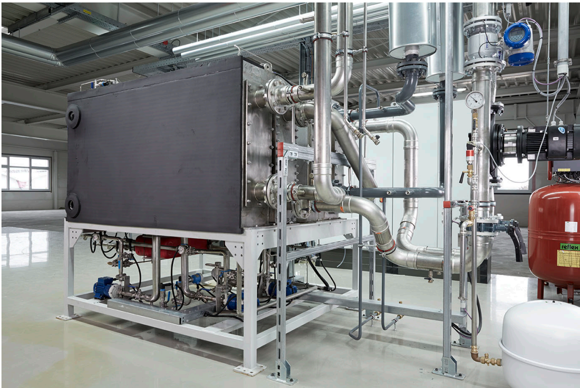
Figure 3: fischer eco solutions absorption chiller with 100 kW cooling capacity.

fischer Rohrtechnik as a leading supplier for stainless steel tubes and its sister company fischer eco solutions as a manufacturer of absorption cooling machines have installed a solar cooling and heating system in their newly built office building in Achern. The working fluids are Lithium bromide as the absorbent and deionized water as the refrigerant. The machine is 100% built of highly corrosion resistant stainless steel by using latest laser cutting and welding technology.