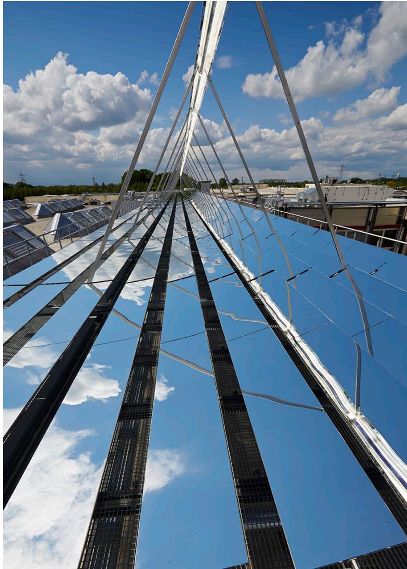
Figure 4: Industrial Solar Fresnel-collector string with a total length of 90 m and 484 m 2 aperture area at Fischer eco solutions in Achern / Germany.

The heat source for the system is a Fresnel-collector manufactured and installed by the company Industrial Solar in Freiburg. The collector string consists of 22 modules with a total length of 90 m and an aperture area of 484 m 2 , which corresponds to thermal peak power of about 270 kW. The heat transfer fluid is pressurized water with an operating pressure of 9 bar. In summer the process heat at a temperature of 130°C is used to power the absorption chiller with a cooling capacity of 100 kW, whereas in winter the heating system of the office building is supported by the solar heat.