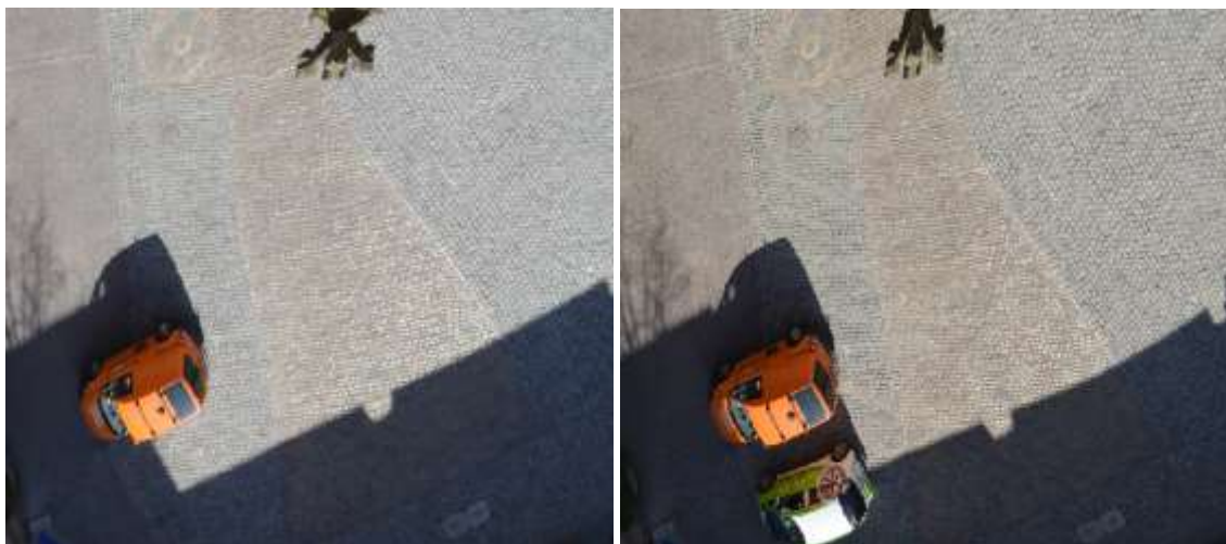
Figure 1. Georectified images from the observation deck of the Marienkirche with different focal distances (left: 18 mm [zoomed in]; right: 48 mm).

The SLR camera used for the test recordings is a Nikon D5100 with a 16.2 megapixel CMOS sensor equipped with an AF-S DX 18-55 mm lens. In a first step, images with different focal distances (18, 35, 48 and 55 mm) were taken to analyze the varying distortions after the georectification in a later step. Focal distances of 48 mm and 55mm are the ones closest to typical airborne image recording systems whereas a focal distance of 18 mm increases the recorded area significantly.