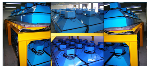
Fig. 2: Multidirectional Muons Detector (MMD) of Cooperation Japan-USA-Brazil, installed in the Southern Space Observatory, in São Martinho da Serra, Southern Brazil.

Besides the three detectors mentioned previously, two another systems were installed in City of Kuwait (Kuwait) and Greifswald (Germany), which together allow the coverage of the celestial sphere of the Earth. The goal is to organize a highly efficient global alert system. Currently, the geoeffective geomagnetic storms forecast can only be done with just an hour in advance, since for this prediction are used data from satellites located in the vicinity of the Planet. With the new data, provided by the International Network of Multidirectional Muon Detectors, or GMDN - the Global Muon Detector Network (see Figure 3) the detection of distribution of Muons will allow the prediction from six to