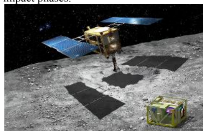
Artist's conception of HY-2 during sampling, also showing Mascot landed on the surface. CREDIT:JAXA/Akihiro Ikeshita.

mineralogical composition and physical properties of the surface and near-surface material including minerals, organics and detection of possible, near-surface ices; (4) the surface thermal environment by measuring the asteroids surface temperature over the entire expected temperature range for a full day-night cycle; (5) the regolith thermophysical properties by determining the surface emissivity and surface thermal inertia; (6) the local morphology and in-situ structure and texture of the regolith including the rock size distribution and small-scale particle size distribution; (7) the context of the observations performed by the instruments onboard the main spacecraft and the in situ measurements performed by Mascot ('cooperative observations') and provide documentation and context of the samples and correlate the local context of the in situ analysis into the remotely sensed global context; (8) the body constitution on local and/or global scales and constrain surface and possibly sub-surface physical properties; (9) the context of the sample collected and returned by the main spacecraft by qualifying its generic value and processed/pristine state and thus support the laboratory analysis by indicating potential alteration during cruise, atmospheric entry and impact phases.