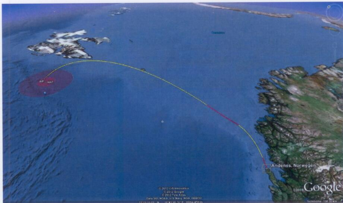
Fig. 4: GPS trajectory of the SHEFEX II flight