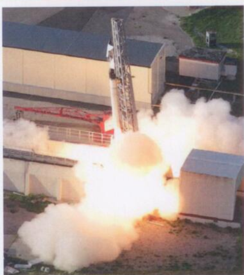
Fig. 1: The SHEFEX II re-entry vehicle

The autonomous control was supported by inertia platforms and a star tracker.