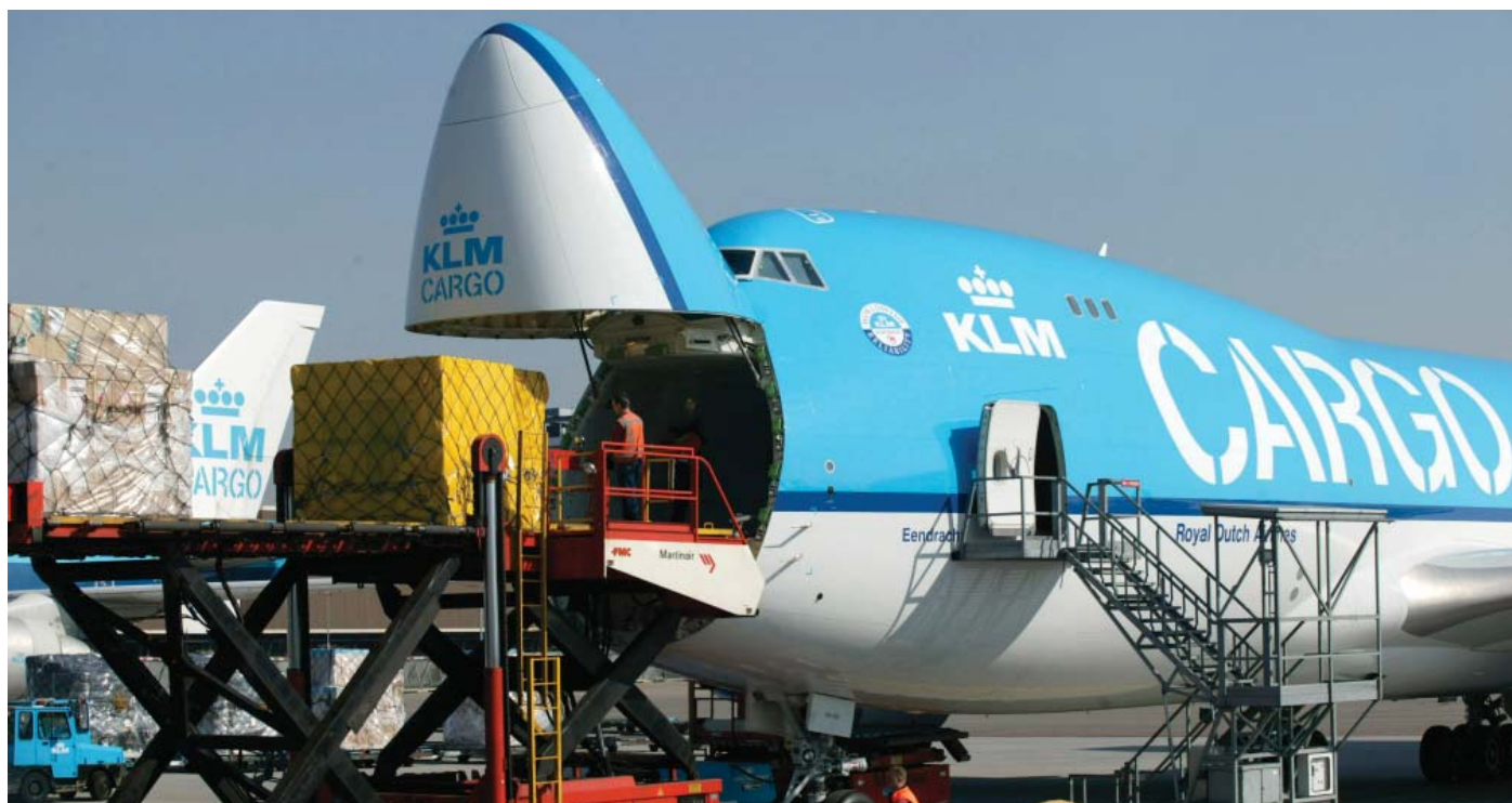
Photo 1: KLM Boeing 747-406F/ER/SCD being loaded

by: Florian M. Heinitz and Peter A. Meincke