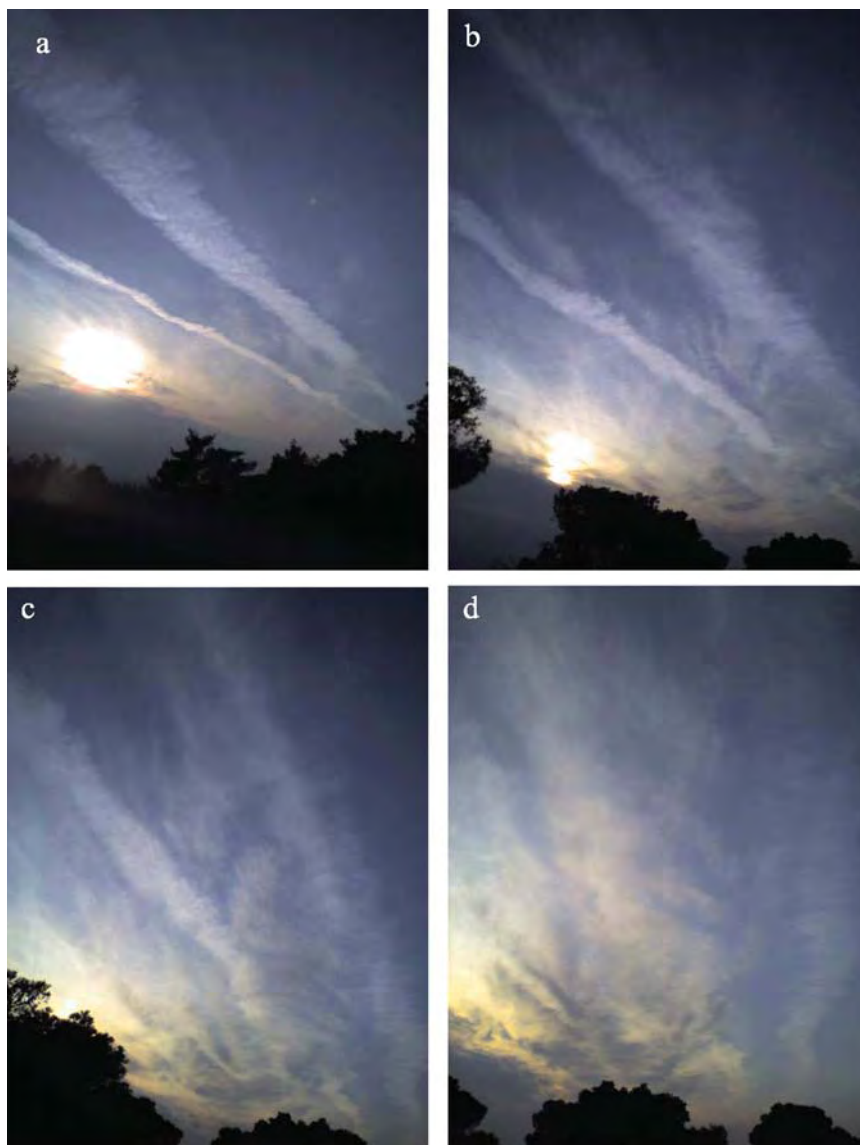
FIG. 2. Photographs of contrail spreading into cirrus taken from Athens, Greece, on 14 Apr 2007 at 1900, 1909, 1913, and 1920 local time (from top left to bottom right).

limited. Fundamental laboratory studies are required to ascertain what makes certain soot particles more active than others, and what role (short lived) contrail and atmospheric processing might play in making exhaust soot more or less active as cirrus IN. New studies of the ice-nucleating properties of aircraft exhaust and other ambient IN measured in situ for conditions in the cirrus temperature and water vapor regimes are needed. Such investigation could be done independently, but it would be most useful within the context of a measurement effort to convincingly relate the ice activation properties of aerosols to the microphysical composition of cirrus clouds that