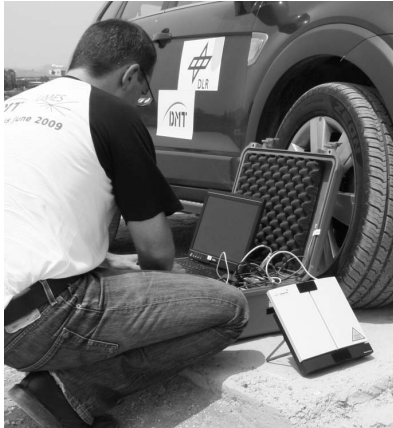
Figure 2: Pointing the Antenna