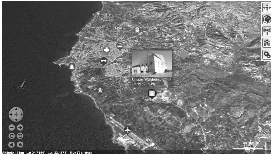
Figure 4: Map of south west cyprus including some real and simulated Points of Interest for illustration

and other relief organizations. These forms can be easily changed as they are rendered using a simple XML (eXtended Markup Language) structure, so the user (or someone in the headquarters) can add his own reports or change existing ones to adapt them to the current situation.