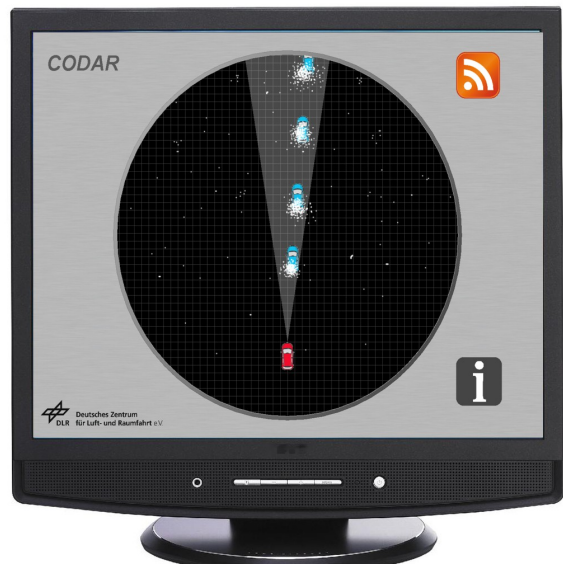
Fig. 1. CODAR Visualization

This poses the question how these measurements can be associated with each other, how incomplete measurements (due to measurement errors or low penetration rates) can be handled, how wrongfully measured “ghost vehicles” can be detected and how noisy sensor measurements can be filtered. Our particle filter implementation provides a solution to cope with all these challenges. More details can be found in [1].