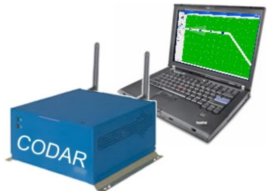
Fig. 4. Simulation Setup: CODAR OBU + m^3 Simulation Laptop

The simulation hardware comprises a screen for the CODAR Visualization (see fig. 1), an Onboard Unit (OBU) that runs the CODAR Fusion Engine (see fig. 4) and a laptop that simulates the application environment m^3 (see fig. 4). Instead of real wireless V2V communication the CODAR Fusion Engine is connected via Ethernet to the simulation environment m^3 which simulates all sensor measurements (see fig. 2). In principle, the CODAR OBU may run in a real vehicle with real sensor connections without any substantial modifications.