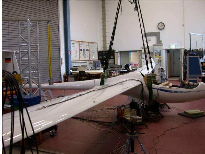
Figure 2 – Ground Vibration Test on a sailplane