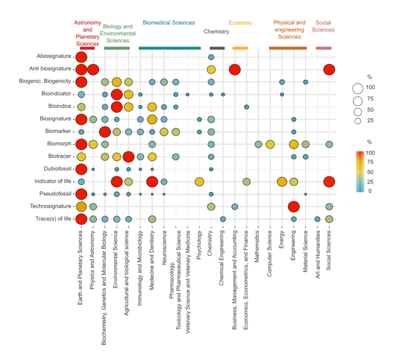
Fig. 2. Usage of "biosignature" and related terms depending on disciplinary context. Standardized number x of articles in each discipline as recorded by Science\ Direct , where x= number of articles for the keyword per discipline / maximum number of articles for the keyword across all disciplines.

geological, agnostic, spectroscopic, direct, indirect, and temporal, and by the prefix techno. It has also been reworked to yield "false biosignatures" and "pseudobiosignatures" (e.g., McMahon & Cosmidis, 2021), and even "abiosignatures" and "antibiosignatures" which are intended to indicate the absence of life (e.g., Chan et al., 2019; National Academies of Sciences, Engineering, and Medicine, 2019; Schwieterman et al., 2019).