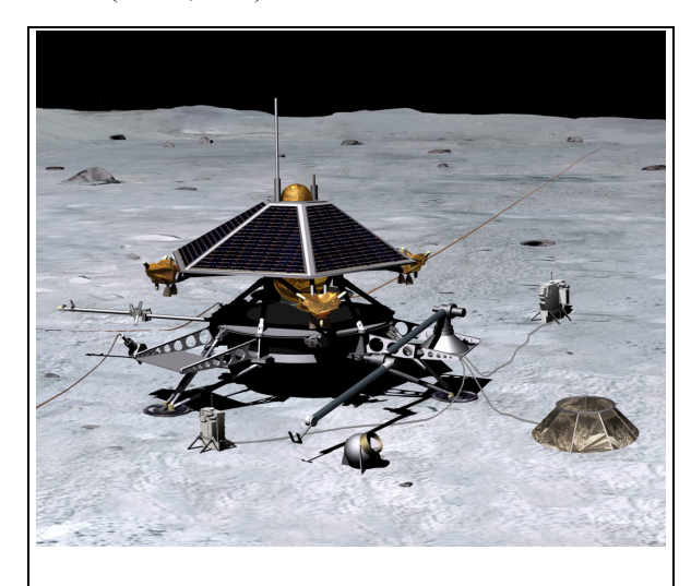
Figure 1: The LUNETTE mission concept (Neal et al., 2010), showing instruments robotically deployed to the surface.

Currently in formulation for response to the anticipated NASA New Frontiers 5 Announcement of Opportunity, LGN consists of a globally distributed network of robotic landers, each of which deploys an identical suite of geophysical instruments: a seismometer, a heat flow probe, a laser retroreflector, and a magnetotelluric sounder (Fig. 1). To maximize science return, the landers should operate continuously for a minimum of 6 years (with a goal of 10 years), and at least one lander should be located on the lunar far side (NASA, 2009).