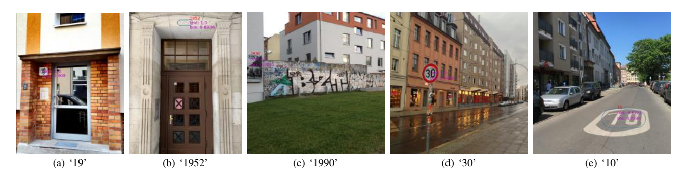
Figure 2. Examples of number strings in STR results. The STR results are listed below the corresponding image as well as displayed on the images.

Figure 1. Examples of STR results on Flickr building images. The number of detection after filtering is written above each image and the STR results, i.e., texts/text scores and box/box scores, are displayed on the images at the corresponding location.