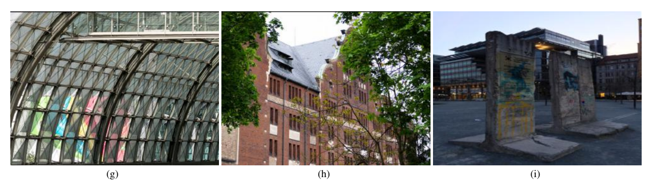
Figure 4. Examples of commercial buildings with no STR results.