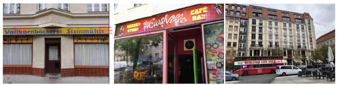
(a) 'Vollkornbackerei', 'Steinmuhle'