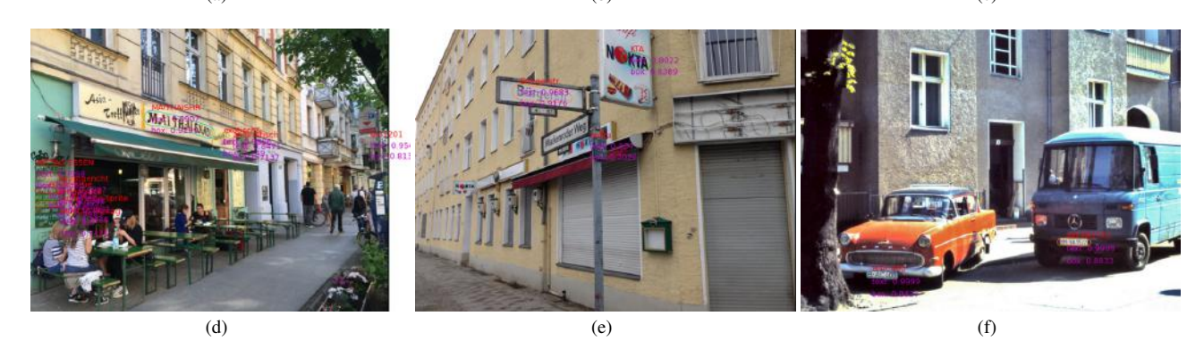
Figure 3. Examples of residential buildings: (a)(b)(c) have no text recognized in STR results; (d) shows a restaurant on the ground floor of a residential building; (e) and (f) show street name signs and car plates in front of the residential buildings leading to text recognized in STR results.

3.4.2 Flickr images with no text recognized by STR Texts were not recognized on 1/2 residential and commercial building images and 2/3 other building images.