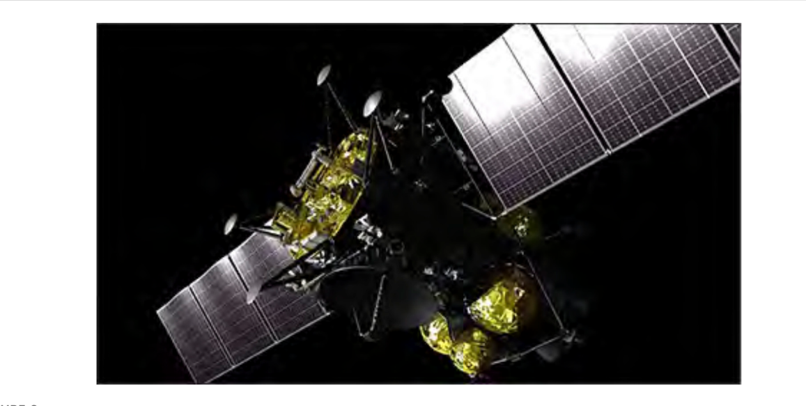
FIGURE 8 The Martian Moons Explorer mission to Phobos and Deimos.

white paper (downloadable at https://doi.org/10.3847/25c2cfeb. 4a582a02).