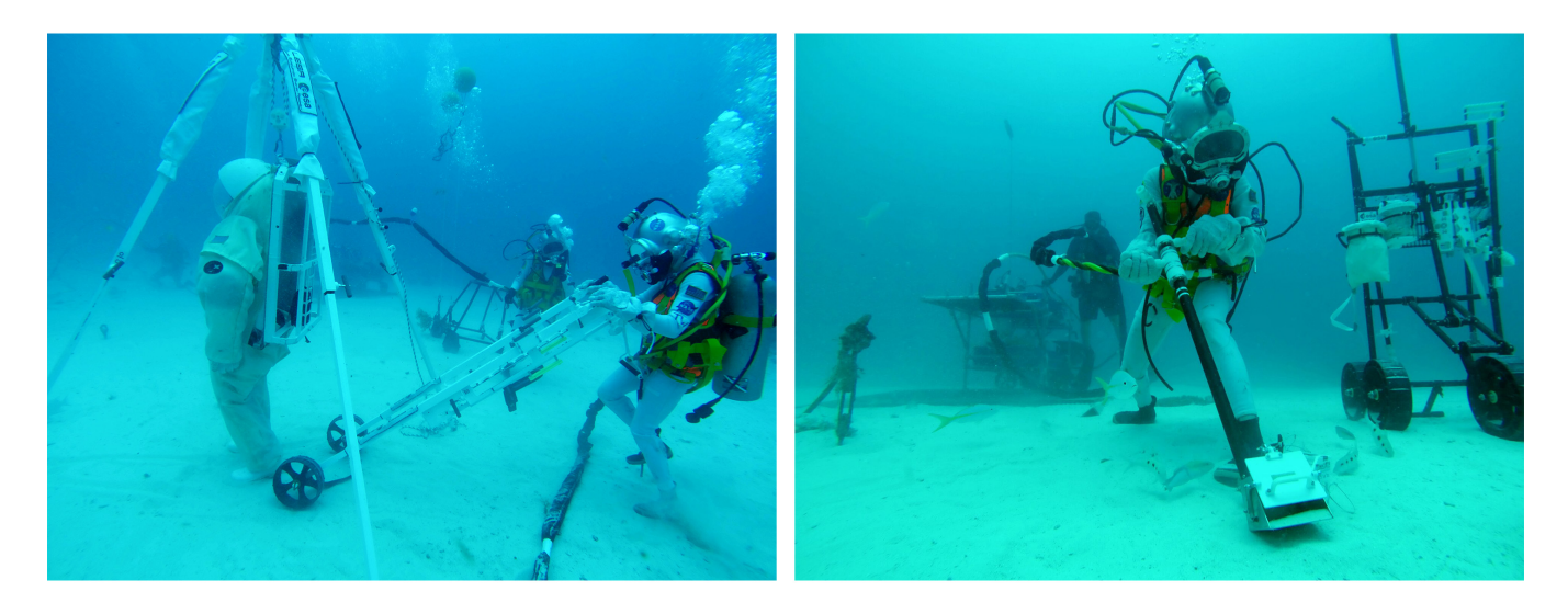
Figure 1: An astronaut simulating the rescue of an incapacitated crew-member with a portable vehicle designed for evacuation in lunar gravity. The underwater weight of this suit simulator was equivalent to the weight of an astronaut wearing an EVA suit on the Moon [31] (left). An astronaut performing simulated EVA operations during an analogue study [32] (right).

activities [11]. In contrast to typical design projects in HCI, the interaction between development teams and end users in space systems engineering is thus rather limited and often only occurs towards the end of a development cycle. As a result, by the time an operational scenario is deployed and assessed at the end of the V-model design cycle, there tends to be little room left to influence the design. This results in longer feedback loops and slower design iterations, incurring further financial and temporal costs on the project.