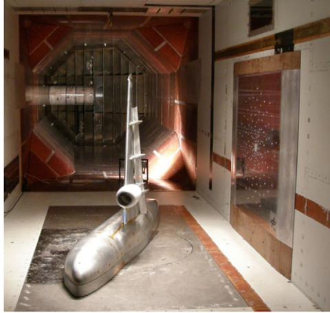
Figure 1. Photograph of the experimental setup with microphone array on the side wall.

and the grid spacing is 1 cm. We compare these results to source maps obtained using two conventional beamformers with and without diagonal removal (cf, e.g., [32]), which are defined by