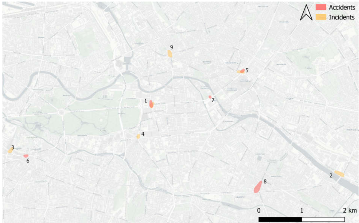
Figure 2: Locations of hazard hotspots in the city of Berlin