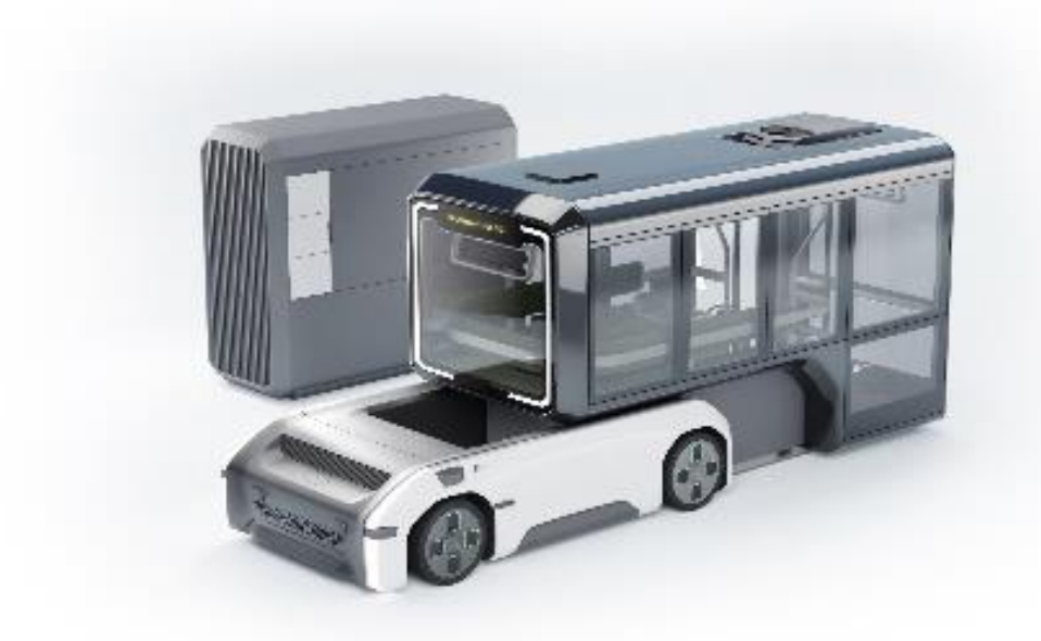
Figure 1 U-Shift Driveboard , cargo and people-mover bodies.

at driving automation level 4 as defined by SAE (2018)^1 . The vehicle is modular as it consists of a 'self-driving', electrically powered rolling chassis ('Driveboard') and an interchangeable vehicle body. The modularity allows to separate the Driveboard from the vehicle body; quickly and without an external device. For example, U-Shift can be equipped with a people-mover body (see Figure 1) to provide ride-sharing service, offering seats for nine passengers and including a wheelchair area. For freight tasks, cargo bodies with up to 1.6 tonne payload can be mounted.