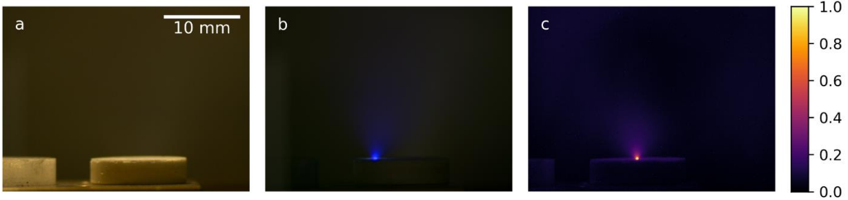
Figure 2: Gypsum sample on the sample stage inside the vacuum chamber before and during LIBS measurements. a) Image before LIBS measurement. b) Laser-induced plasma plume during LIBS measurement. c) False-color image of emission captured with a 656.3 nm bandpass filter.

operates at a wavelength of 1030 nm with a pulse energy of 17 mJ and a pulse duration of 7.8 ns. The spectrometer covers a wavelength range from 350 nm to 910 nm with a spectral resolution of about 0.4 nm.