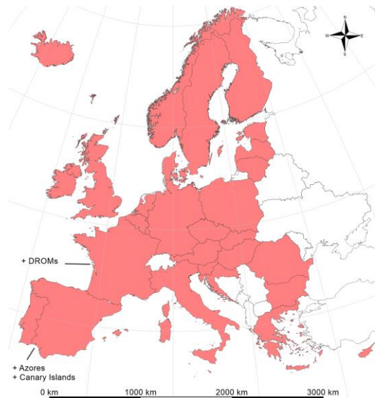
Fig. 1: EGMS initial coverage (including also French Overseas Departments and Regions).

resolution InSAR datasets over Europe have recently been proposed [6], full-resolution processing is more complex, potentially revealing errors otherwise disguised or suppressed, but in return providing the highest level of detail currently possible. The EGMS represents the first challenging application of InSAR technology to spatially and temporally high-resolution monitoring of ground deformation over an entire continent in a harmonized and continuous way.