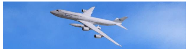
Fig. 2. Generic model of an airlaunch system

rockets and spacecraft for orbital and suborbital missions as well as the return of reusable spacecraft.