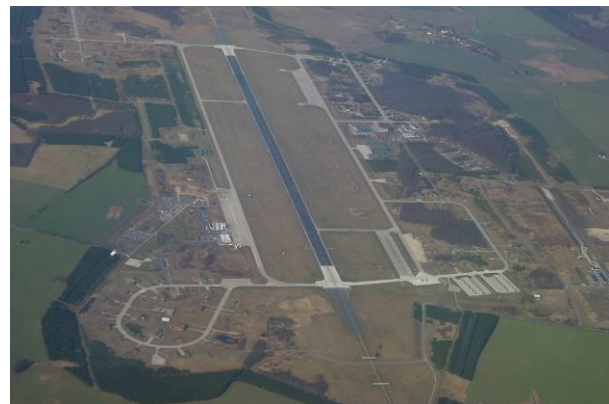
Fig. 1. Proposed Air & Spaceport Rostock-Laage

The study therefore focused on the airlaunch of