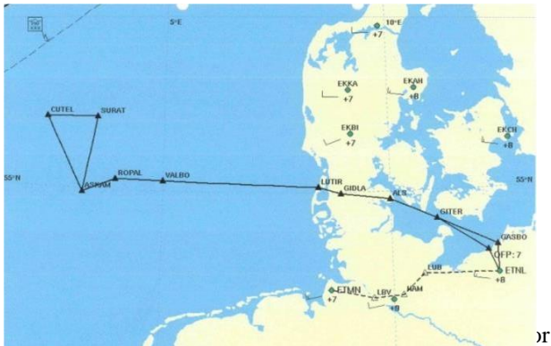
Fig. 4. Possible flight plan starting at Rostock-Laage for launch area North Sea, takeoff alternate: Nordholz Source: Gepar Aerospace

Source: DLR, Map by OpenStreetMap and OpenStreetMap Foundation