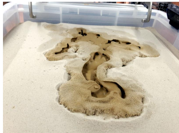
Figure 2: An example of the resulting morphology of a mud flow formed on "warm" sand. The edge of the flow is surrounded by set of sandy ridges and several central troughs through which the mud propagated are visible. The width of the plastic box is 0.4 m for scale.

Our work shows that the behavior of mud and its propagation in a low pressure environment is strongly dependent on the surface temperature as freezing [see the LPSC abstract #1511 for details] or rapid boiling would significantly change the final morphologies of resulting surface flow features.