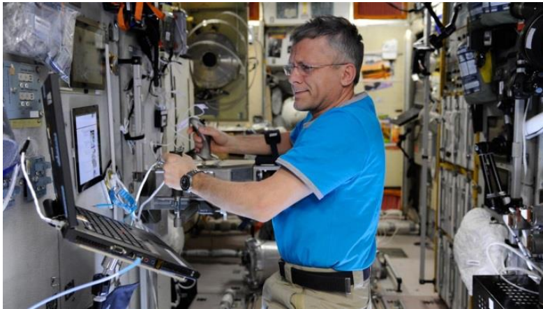
Figure 2. Cosmonaut Andrei Borisenko at the experimental workstation on board the ISS.

Apparatus. The same joystick was installed on board of the Russian Zvezda service module of the ISS (see Figure 2). Body stabilisation was realised by rails on the module "bottom" and an additional grip for the left hand. The experimental GUI window was displayed on the 15.4" TFT display of the notebook (same as in Study 1).