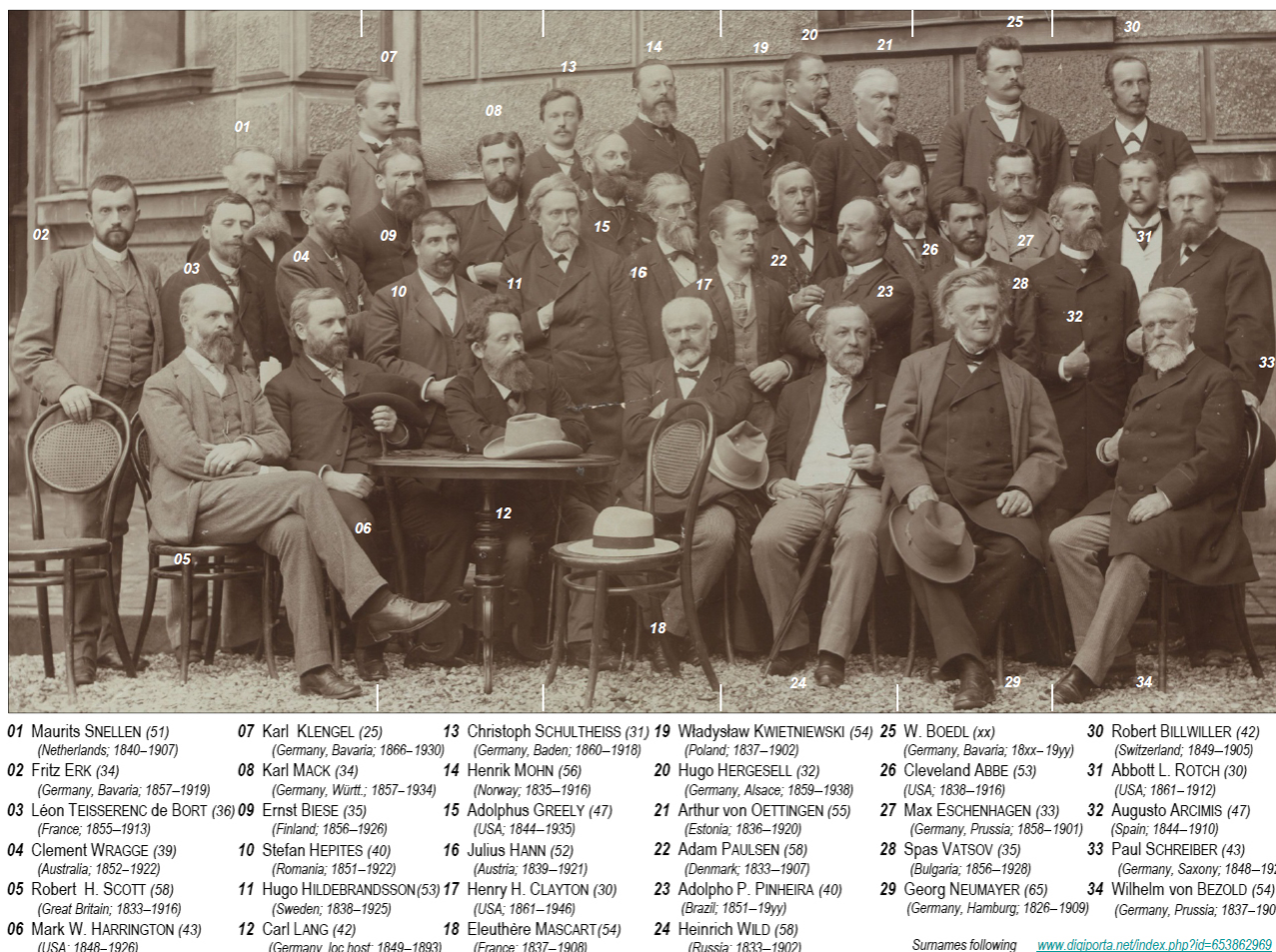
Figure 1. Participants at the International Conference of Directors of Meteorological Services, in Munich, Bavaria, Germany, 26 August–2 September 1891, 28 years prior to the formation of the Section of Meteorology. Numbering is in six columns, from left to right, with the following information for each person: number, first name, surname (age at conference, representative for country or state, and lifespan). The surnames follow the handwritten note attached to the copy kept at Deutsches Museum, Digitales Porträtarchiv, Munich, Germany (cf. website http://www.digiporta.net ; last access: 25 January 2019).

pean nations plus the USA and Russia) focused their attention on the need to improve and expand observations for weather forecasting. Their efforts eventually led to the first International Meteorological Conference in Vienna in 1873 and the formation of the International Meteorological Organization (IMO) in 1879 (and, much later, inspired the formation of the World Meteorological Organization (WMO) in 1950). The IMO was led by an International Meteorological Committee composed of the directors of the meteorological services of the member nations.