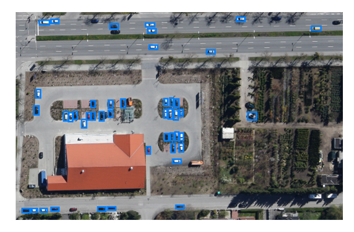
Fig. 3: Vehicle detection result using ShuffleDet on the 3K-DLR-Munich dataset.

To evaluate the generalization ability of our method, we train it on the 3K-DLR-Munich dataset [13]. This dataset contains aerial images of 5616 \times 3744 pixels over the Munich city. Due to the large size of each image similar to [5], we chop the images into the patches of 512 \times 512 pixels which have 100 pixels overlap. To prepare the final results, for each image, we merge the detections results of the patches and then apply none-maximum suppression. Figure 3 illustrates a detection result of our algorithm for the 3K-DLR-Munich dataset.