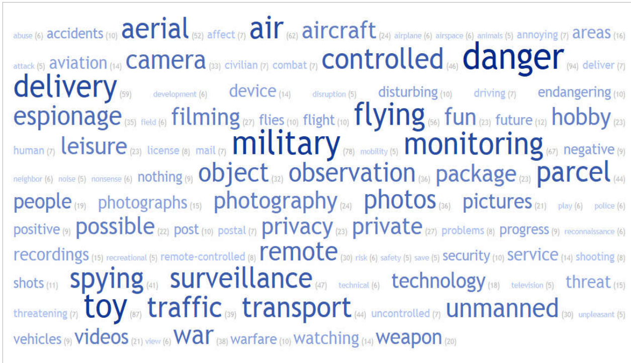
FIG. 1. Associations with the term drone. Word cloud based on frequency

To provide a further view of the diversity of associations figure 1 provides a word cloud of associations reported, showing the top 98 words with highest frequency out of 715 possible words in alphabetical order. The size and colour saturation represents the frequency.