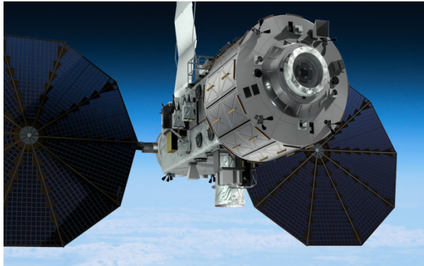
Fig. 2. Orbital-Hub's Free Flyer.

The dockable Free-Flyer (Fig. 2) is part of the Orbital-Hub concept in response to the scientific user requirements. It is intended to fly uncrewed in a safe formation with the Base Platform for e.g. three months periods until it can be maintained or reconfigured when docked to the base for short duration (approx. two weeks). At its aft a service module provides attitude and orbit control and also formation flying and independent power and thermal control. Furthermore, it contains a pressurised module for \mu g-research which can be accessed by the crew when docked to either the Base Platform (e.g. via the docking node or via the expandable habitat module) or directly to a crew vehicle. An external science platform builds the centre of the Free Flyer. It has a berthing structure for any external payload and provides power, data and thermal conditioning.