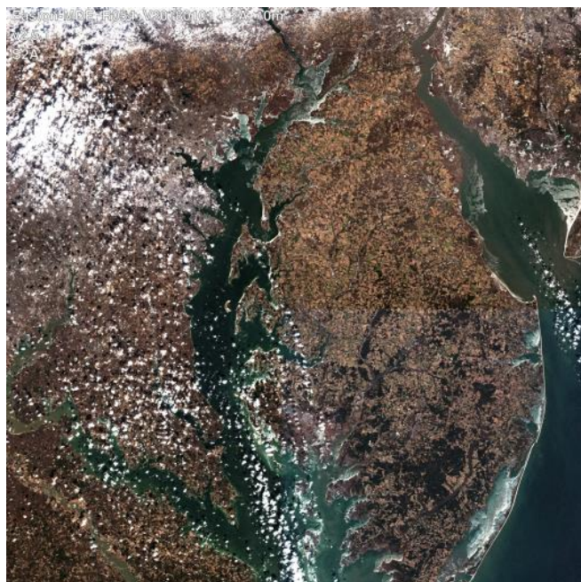
Figure 3: Sentinel-2A L2A image composed of four tiles (from upper left to lower right: T18SUJ, T18SVJ, T18SUH, T18SVH). Lower right tile T18SVH appears brighter than the three others tile due to different AOT content estimates.

Inside the Sen2Cor atmospheric correction module, the CAMS AOT is converted to visibility (km) using the altitude of the CAMS DEM. The visibility obtained is then used in the radiative transfer equations with Sen2Cor Digital Elevation Model information (native resolution of 90 m) to compute the surface reflectance for Sentinel-2 bands. A further step is performed to check if negative reflectance values are obtained. If so, the visibility is slightly increased (corresponds to an AOT decrease) to reduce the amount of negative reflectance pixels.