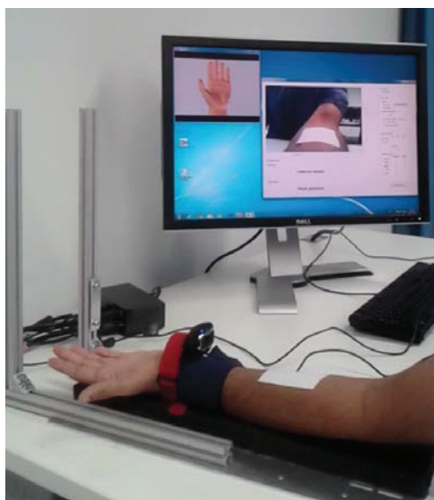
Figure 1: The experiment setup, where a subject is following the stimuli on the monitor with a sticker stuck on to the left forearm and a camera attached to the arm to capture its deformations

An elastic band is used to strap a camera onto the forearm. The images are recorded at a resolution of 640x480 pixels at a frame rate of 25 frames per second. Artificial lighting (from LED lights) is used in these experiments to achieve uniformity in the experiments and to avoid changes in illumination caused by natural light. Motion blur was also physically suppressed to a certain extent by using a velcro band around the forearm and the camera to prevent upwards vertical movement. The images are pre-processed to obtain the ROI using the computer vision library OpenCV and then passed to a CNN, which is implemented using the TensorFlow software library.