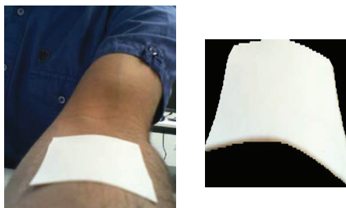
Figure 2: (left) The sticker attached to the forearm of a subject; (right) segmentation of the sticker

There were two subjects with the dominant hand being their left, while the others were right handed. The average age of the participants (three female and 7 male) is 26.2 \pm 3.65 years. A plain sticker was stuck on to the anterior side of each subject's arm. Once prepared for the experiment, the subject was asked to place the forearm (freely) on a plain