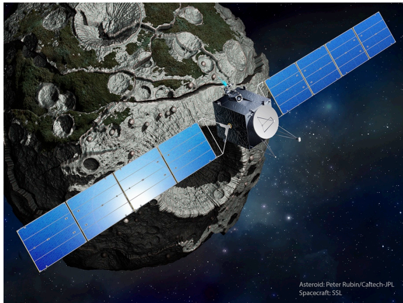
Fig 1: Discovery-class investigation of Psyche. The mission plan includes solar electric cruise, arrival at Psyche in 2026, and 12 months of science operations.

Hit-and-run collisions could create Psyche: Despite living on this planet and being able to study it more closely than any other, we continue to revise our models of Earth's core, in part because we cannot see