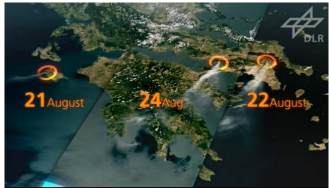
Figure 2: Illustration of fire hotspots and their particle dispersion

Particle Forecast (and Alerting) Service: This scenario demonstrates server side processing of particle dispersion forecast, like volcanic or fire emissions (Figure 2) based on real-time EO datasets. The 4D (3D + time) dispersion model is published in ODA services and intersected with user specified n-D spaces such as administrative boundaries or flight paths to trigger an alerting service.