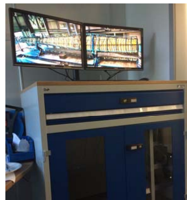
Figure 2: E.V.A.R. system

Based on the OnQA-System [2] for autoclave processes in aerospace industry a new system, adapted to the needs of wind energy industries has been developed (see Figure 2).