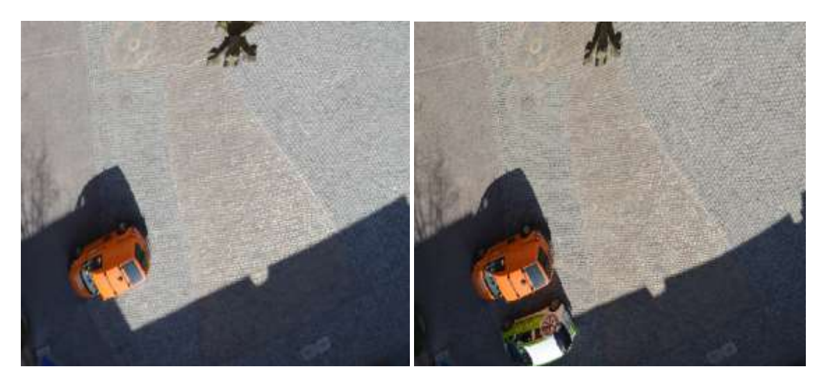
Figure 1. Georectified images from the observation deck of the Marienkirche with different focal distances (left: 18 mm [zoomed in]; right: 48 mm).

The SLR camera used for the test recordings is a Nikon D5100 with a 16.2 megapixel CMOS sensor equipped with an AF-S DX 18-55 mm lens. In a first step, images with different focal distances (18, 35, 48 and 55 mm) were taken to analyze the varying distortions after the georectification in a later step. Focal distances of 48 mm and 55mm are the ones closest to typical airborne image recording systems whereas a focal distance of 18 mm increases the recorded area significantly.