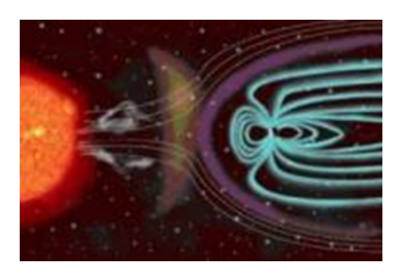
Fig. 1: Artistic representation of Sun - Earth relationship, now called Space Weather. The solar variability is the main source of disturbances in vicinity of Earth.

occurrence of disturbances in Geospace around the Earth and thus, provides the prediction of Geoeffective Magnetic Storms [4, 5, 6, 7, 9].