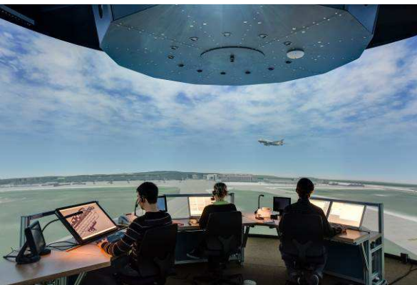
Figure 2. ATS 360° projection system.

Assessing the feasibility of new concepts and tools can be realized using various approaches. We decided to use a workshop with high-fidelity HITL simulations. During the simulation runs, observers recorded the behavior and comments. This data were complemented by elaborate semi-structured guided interviews with mainly open-ended questions in the debriefings after each simulation run.