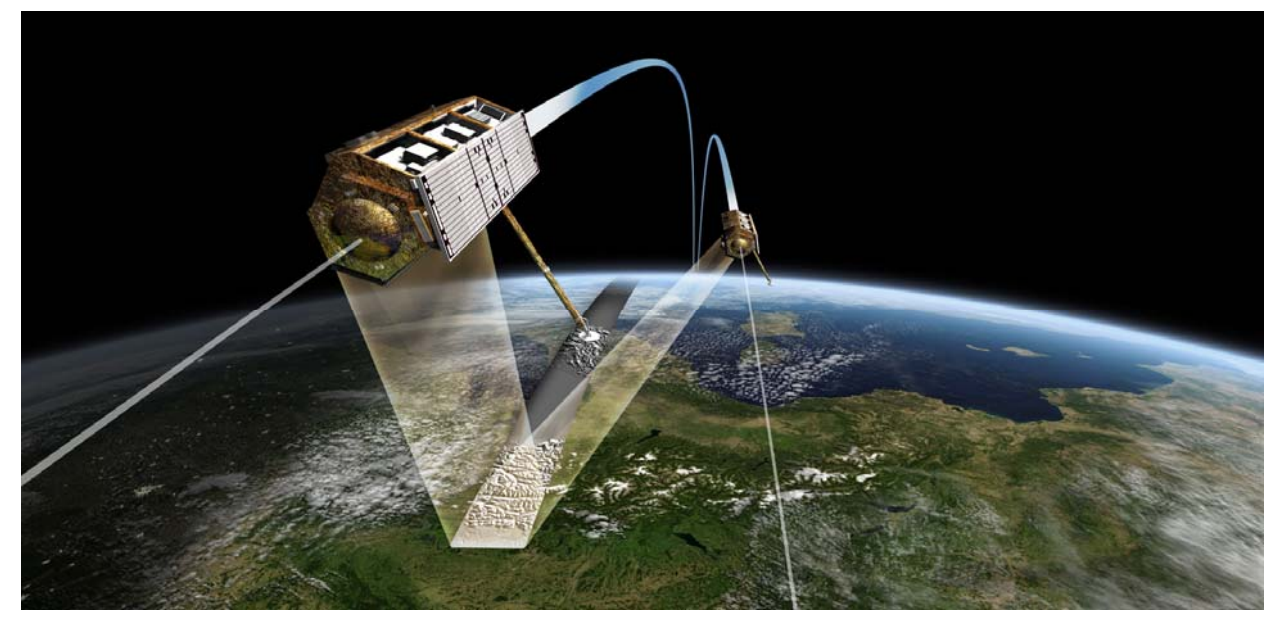
Figure 1 TerraSAR-X and TanDEM-X flying in close formation

mode on each of the two satellites and/or by adjusting the along-track distance between TSX and TDX to the desired value. Combining both modes will provide a highly capable along-track interferometer with four phase centers. The different ATI modes will e.g. be used for improved detection, localization and ambiguity resolution in ground moving target indication and traffic monitoring applications. Furthermore TanDEM-X supports the demonstration and application of new SAR techniques, with focus on multistatic SAR, polarimetric SAR interferometry, digital beam forming and super resolution.