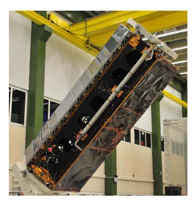
Figure 2 Fully integrated TanDEM-X satellite

The TDX satellite is a rebuild of TSX with only minor modifications [2]. This offers the possibility for a flexible share of operational functions for both the TerraSAR-X and TanDEM-X missions among the two satellites.