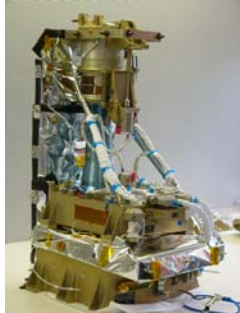
Fig. 2: DAWN Framing Camera with removed MLI.