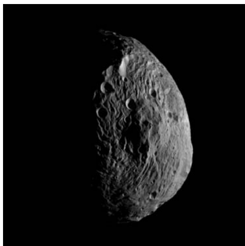
Fig. 1: Dawn FC clear filter image of Vesta obtained on July 18, 2011.

The FC cameras onboard the Dawn spacecraft are expected to map the asteroid 4 Vesta in seven different colors from Survey Orbit in August 2011. We will present the first immediate results of the spectral mapping of the visible surface from FC images along with their association with surface compositional units. The first medium resolution observations of Vesta have been performed in July 2011 (Fig.1).