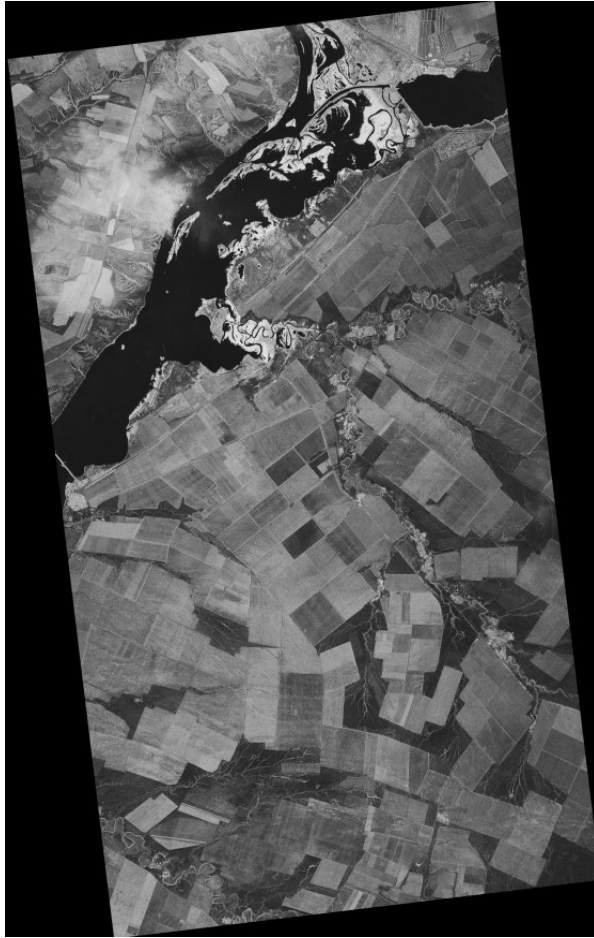
Figure 2 - First TerraSAR-X image, Tsimlyanskoye reservoir, taken 19 June 2007, 15:03:24 UTC