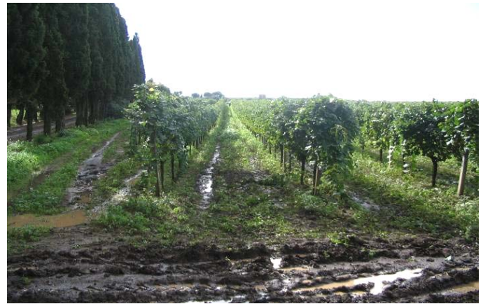
Fig 6. Wet soil conditions on 5 October 2005.