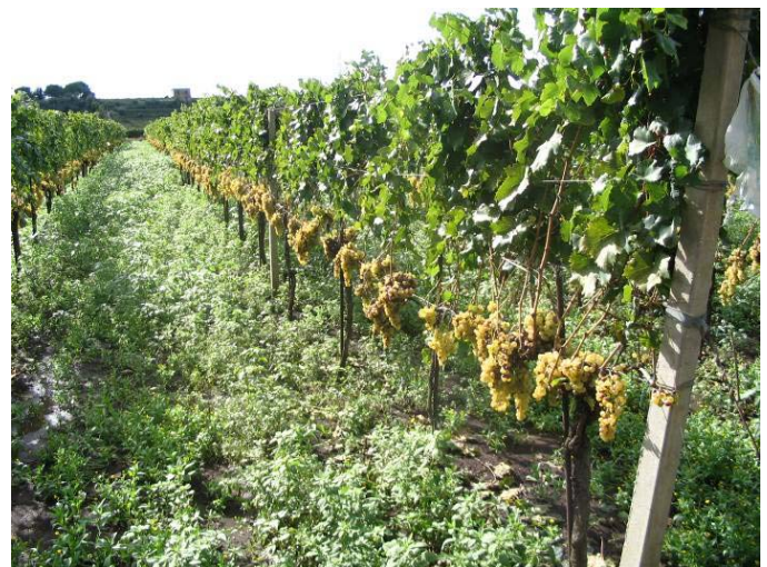
Fig 3. Parameters of plants, grapes and supporting structures were measured.

Each SAR image has been radiometrically calibrated using also a DEM to evaluate the local incidence angle and a layer stack has been created for easier data handling. The L-band RGB composite images of the central part of the study area are reported in Figs. 4 and 5.