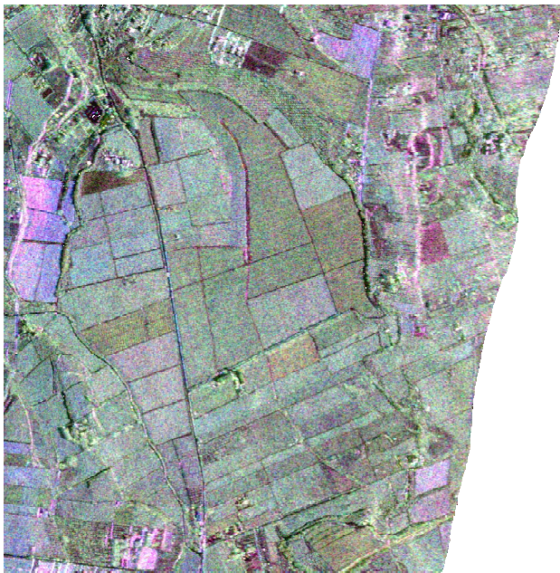
Fig 5. Part of the vineyards in the Frascati area imaged at L-band, vv, hv, hh polarizations (RGB) on 25 October 2005.