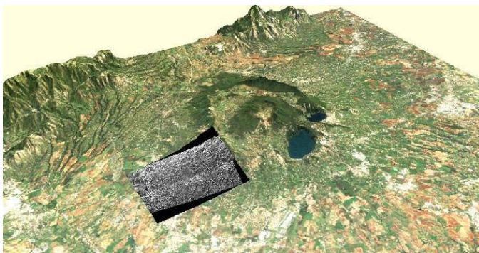
Fig 2. The Frascati imaged test site (in gray) within the wide Castelli Romani area and the SE outskirts of Rome, Italy.

The SAR acquisitions were accompanied by contemporary ground measurements on the vineyards. An extensive survey identified the general conditions of vegetation and of the