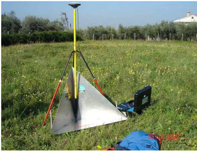
Fig 1. Corner reflectors were deployed for georeferencing.

placed, one in each strip, as ground control points for georeferencing (Fig. 1). The flight paths were almost parallel to the ERS 2 and ENVISAT ground tracks, to allow comparison with archived data. The imaged surface is shown in Fig. 2, in the frame of the Colli Albani area and of the urban outskirts of Rome.