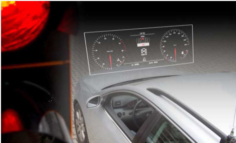
Figure 4: Example of the Traffic Light Assistant demonstrated in DLR's research vehicle.

by red lights. The EV sends CAM messages indicating the vehicle's type, speed and alert state (light bar and siren in use). By decoding the message, the RIS determines the direction and reacts on the EV by switching to the correct phase, stopping any crossing traffic.