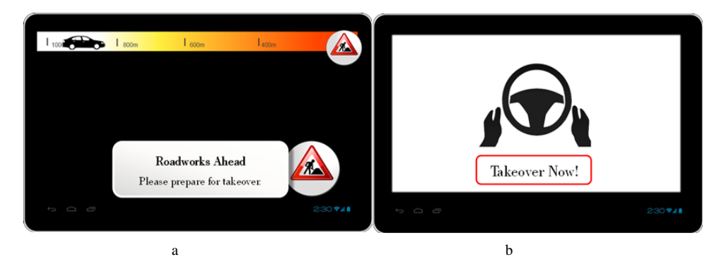
Figure 2: Early information about a pending takeover request due to roadworks (a) and the takeover request on the tablet-pc of the driver (b).